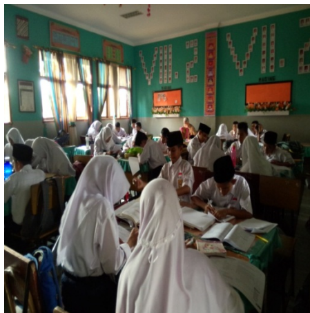
Figure 1. Students conduct discussions related to the material provided by the teacher

The core learning model is useful for connecting and constructing acquired understandings. CORE models students are required to be able to build competencies and understandings obtained from a variety of literature and pour in an idea or a problem-solving. Following are the activities of students and teachers during the learning process.