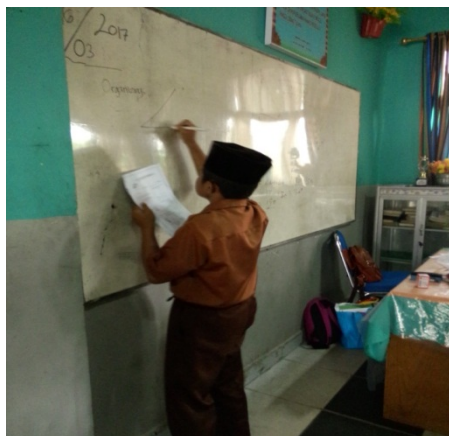
Figure 2. Students present the results of the discussion